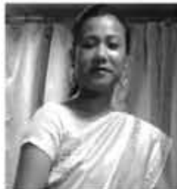
by: samita.Chetri Siliguri.

Remembrance is not a river, That flows or stops by. It is not a flower, That blooms or decays away. It is not a word, That is read once and forgotten. It is not a firewood, That burns and turns to ashes. It is not a rising Sun, That sets after Sunset. It is not a song, That is sung to soothe the mind. It is not a tear, That rolls down in joy or sorrow. It is not a journey, That reaches its goal. It is not a game, That ends in win or loss. It is not a time, That ticks on endlessly. It is not a thing, That is bought or sold. Remembrance is that pure feeling, That binds every relation all through!